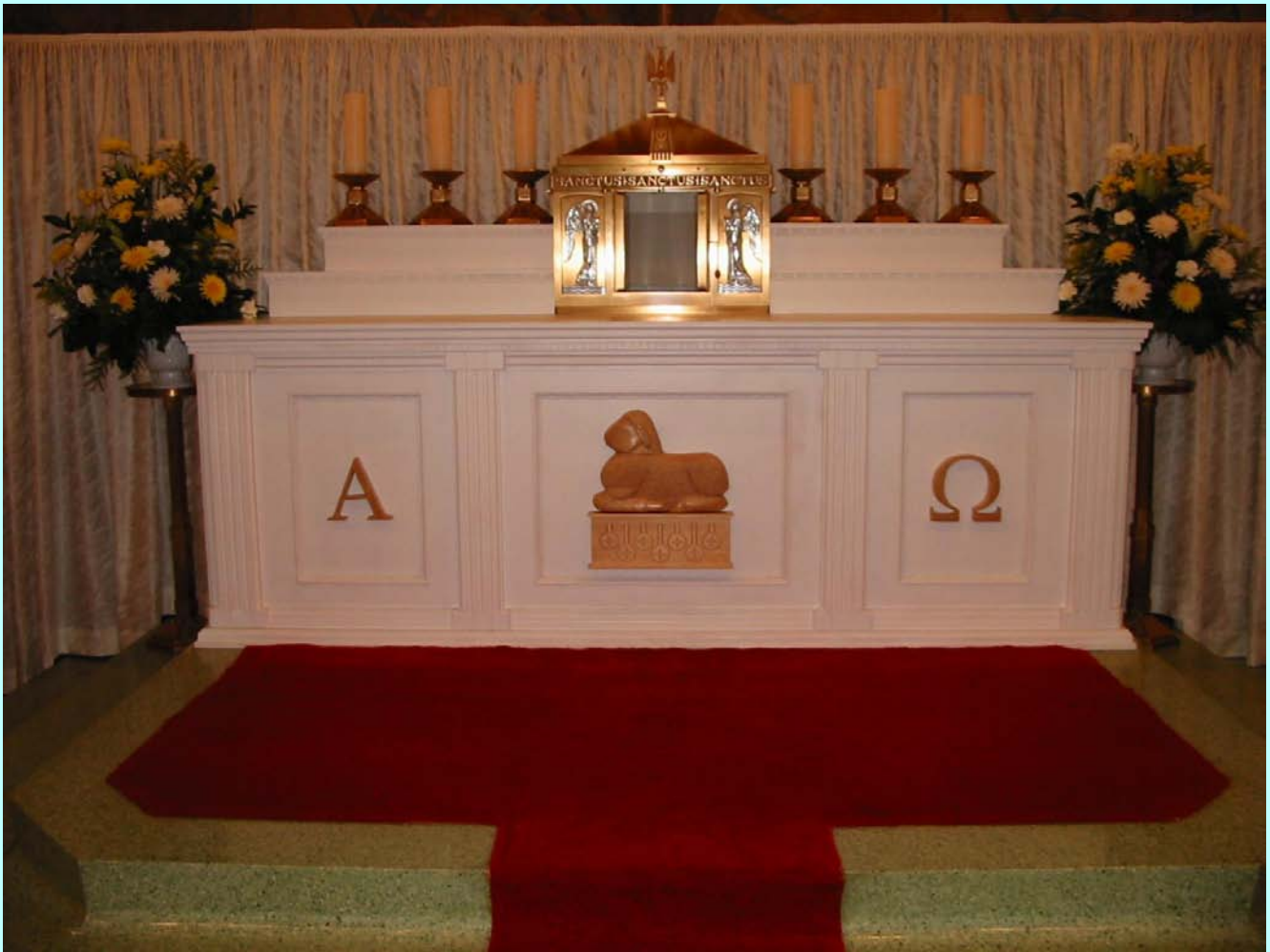
Installation of New Altar